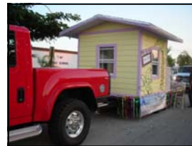
Rechtien Trucks International pulled the UFF holiday float.

"Last year we just wanted to get our name out there, so we borrowed a truck from Toyota of Stuart, slapped