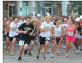
More than 150 runners and walkers participated in the 2007 Stop the Tears 5K.

The first 125 entries will receive a free event T-shirt and goodie bag. Event sponsors include Tropicana, Little Caesar's Pizza, Cost Cutters and Home-Crete Homes.